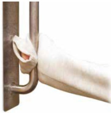
FACT! 59% of Men use their sleeve to open a toilet door