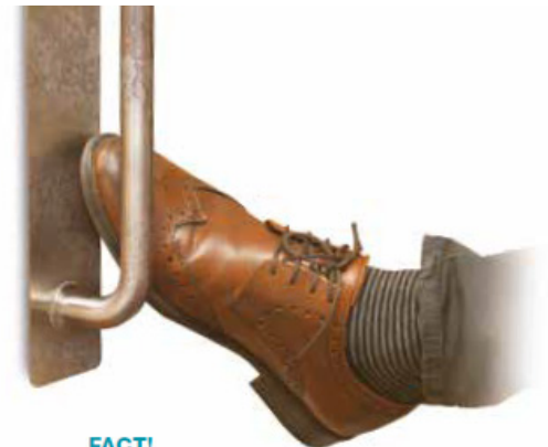
FACT! Some men even admitted to this