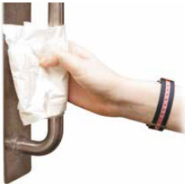
FACT! 67% of Women use a paper towel to open a toilet door